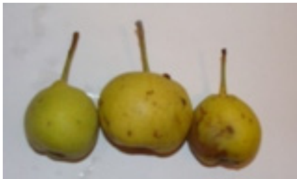
Figure 3. Pear Letna kajkushka