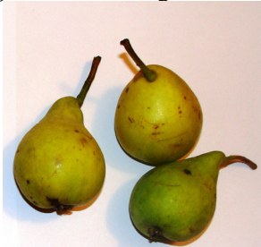
Figure 2. Pear Evropsko avche or Petrovka