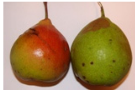
Figure 5. Pear Vodenka or Sumlija