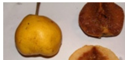
Figure 6. Pear Zimnica or Mitrovka