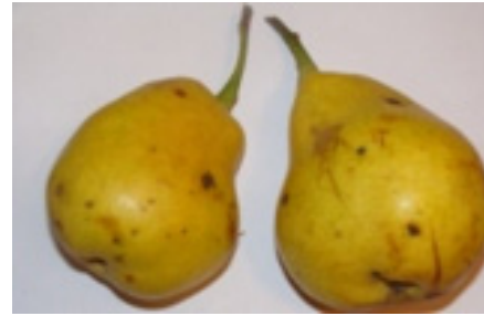
Figure 4. Pear Karamanka