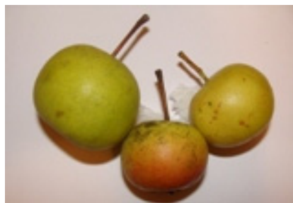
Figure 7. Pear Zimska kajkushka or Badnikarka

In the region of Skopje, the analyzed pear varieties flower in the first decade of April (April 10). The pear variety Carigradsko avche flowered at the earliest (April 8) and Zimnica flowered at the latest (April 13). The average duration (energy) of flowering of the re-searched pear varieties is 13 days. According to the flowering time, the researched pear varieties are characterized as early-flowering varieties. Depending of the climatic conditions, different varieties have different time of flowering. According to Dimitrovski [7] the variety Carigradsko avche is a late to intermediate-flowering variety, but the variety Evropsko avche is an early-intermediate