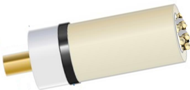
Figure 2. Schematic representation of a working electrode, with active electrode surface modified with gold nanoparticles